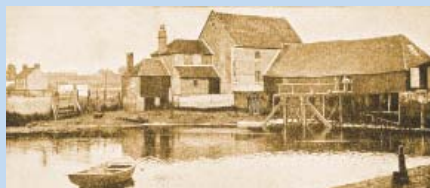
slipper mill circa 1910

part of a complex of four working mills in Emsworth supplying meal for the Navy in Portsmouth. Slipper Mill ceased functioning in 1936 and the mill and its pond were sold off. The remaining building is the former Slipper Mill store. The mill itself and the mill house were on the North side towards the pond where the garages are now. The undershot mill-wheel is still in position underneath them and the tail race opening can be seen underneath the balconies on the West side of the building.