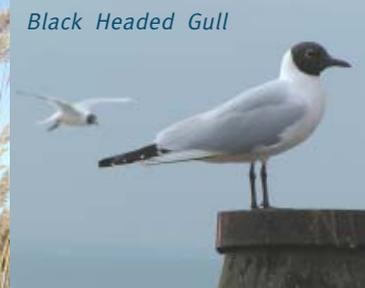
Black Headed Gull