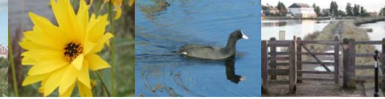
North Bank Emsworth - Chichester Road A259.