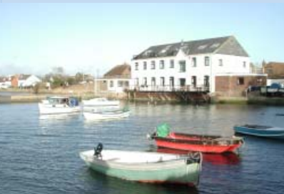
slipper mill today

First records (1640) show the Slipper Mill Pond site as Norton Common, with a branch of the River Ems flowing along its axis.