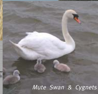
Mute Swan & Cygnets