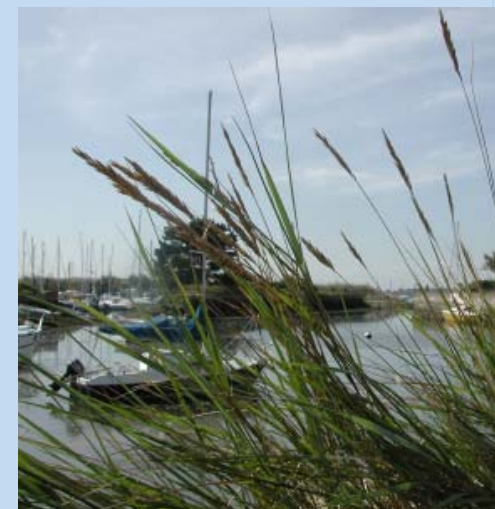
Sea Couch Grass

Tentacled Lagoon Worm and the Starlet Sea Anemone. It also has an interesting species of tube worm, which leaves tube-like casts. Diving duck, including Tufted Duck, Goldeneye, Red-breasted Merganser and Smew have all been seen, as well as Little Grebe, Kingfisher and Little Egret. Breeding birds include Moorhen, Coot, Mallard and Mute Swan. The pond also is a nursery area to young fish. Grey Mullet can be present in considerable numbers.