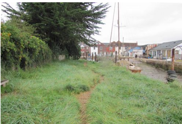
Path looking North towards Queen Street

In loose terms to the South the parcel abuts the slipway flanking the main garden of Wharf House. The West boundary follows the hedge line as far as No 29 Queen Street. The gate is the North boundary and the area in discussion includes the moorings on the West bank of Dolphin Creek