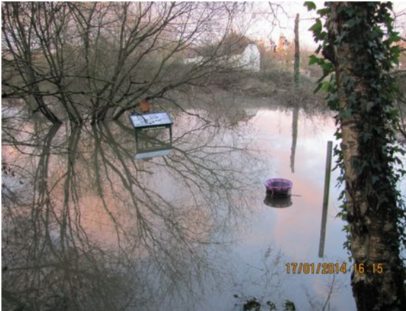
Brook Meadow South field