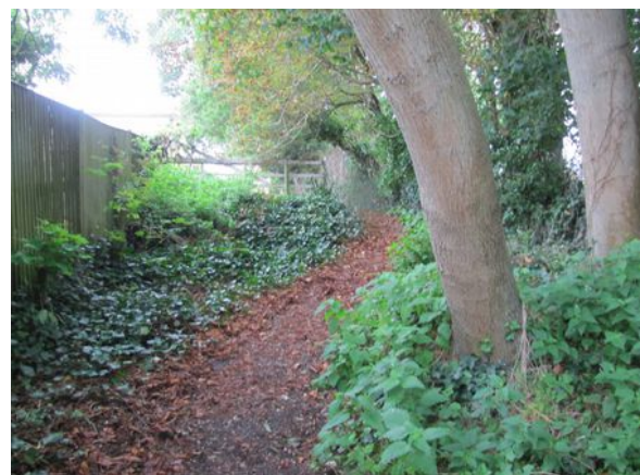
West towards the gate