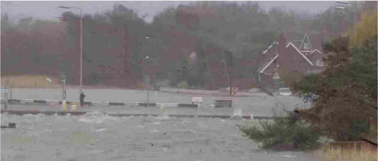
Slipper Pond – tidal flooding - looking North across A259 with Peter Pond

Recent storm events in the Atlantic and the devastating damage are a reminder that we too are at risk of inundation. It is worth each of us making due provision for extreme events. Apart from the direct effects of high winds we are subject to two main threats – tidal flooding and high river levels.