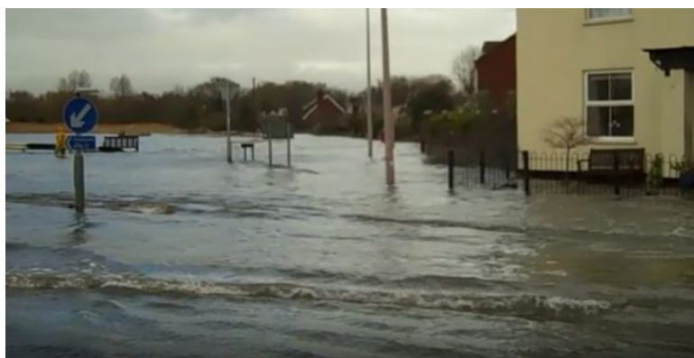
Looking North from Slipper Road across the A259 and Lumley Road