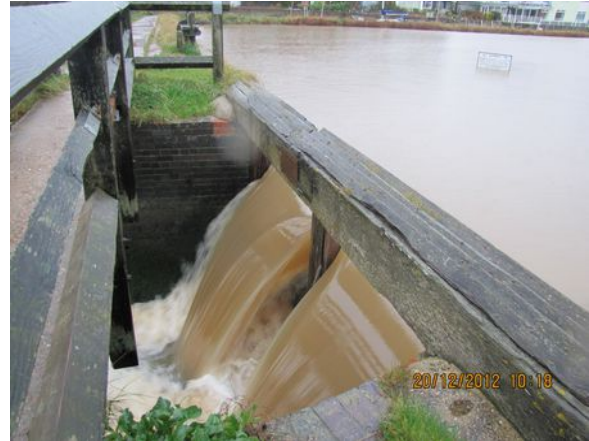
Slipper Pond Tidal Gates - full flood flow