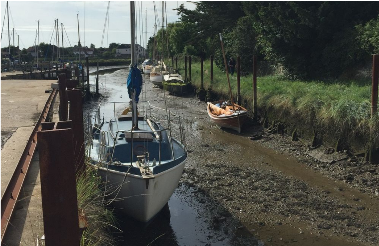
Dolphin Creek and footpath