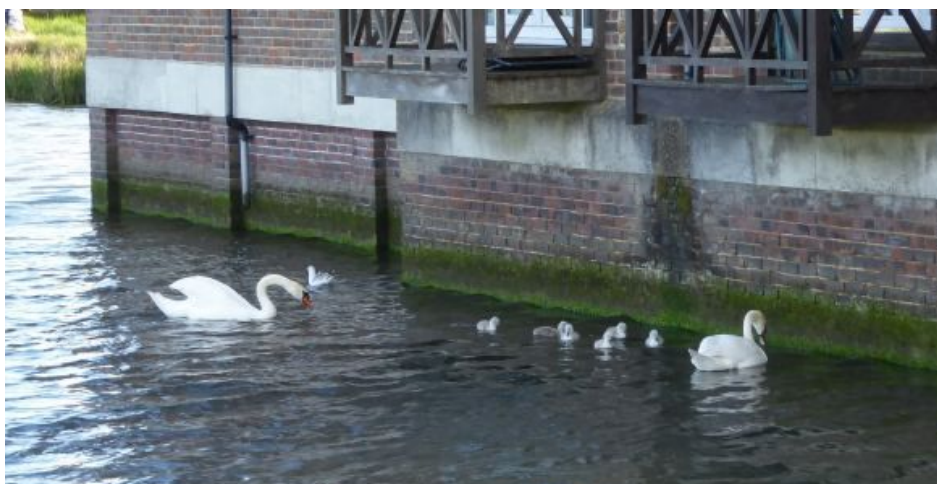
Mute Swan family from Peter Pond - 13 th May

In the January Newsletter we reported that the Northern raft was launched so in February a replacement Coot House was installed – soon to be appropriated by an industrious couple who took no time at all to fill it with reed fragments and other bits and pieces.