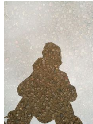
“Cast in Stone”