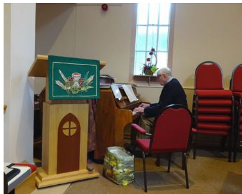
“Saturday Morning Music”