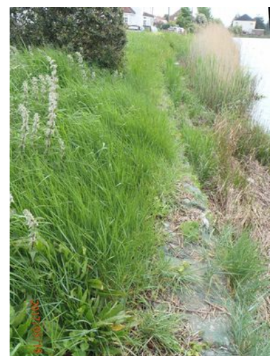
Bag reinforcement - growth

The volunteers' work has certainly paid off!!!