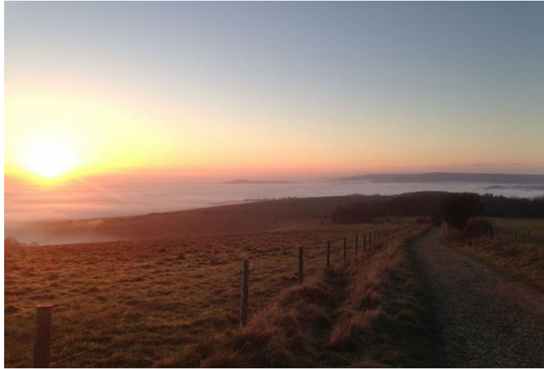
“Low Sun” Winner