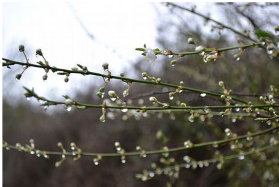
“Droplets” Sophie Green - Year 4 – Southbourne