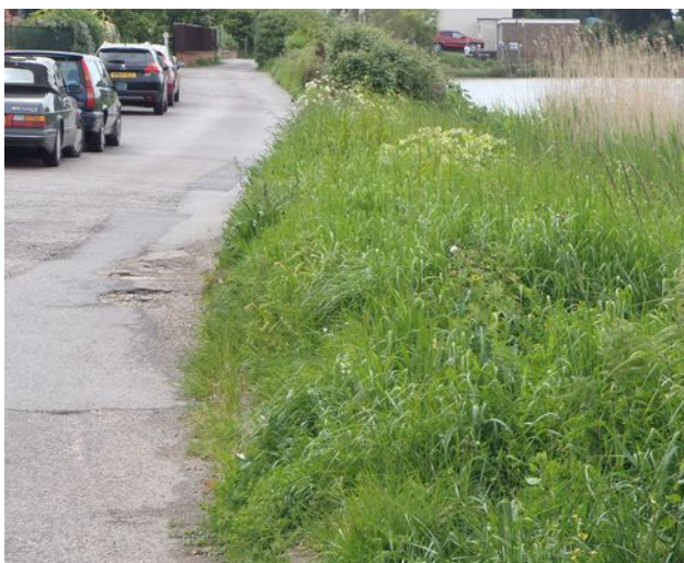
Sleepers disappearing - 16 th May