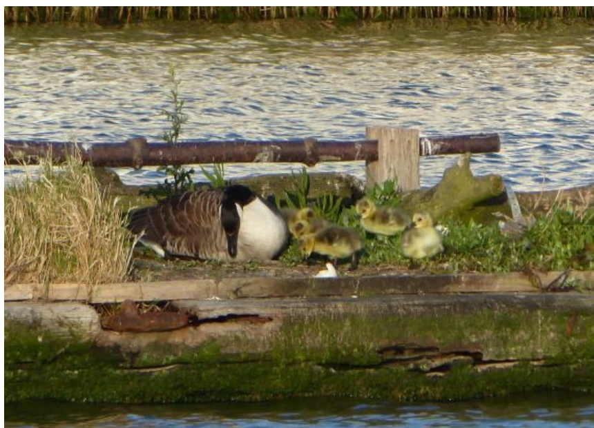
Canada Geese with 5 newly-hatched goslings - 13 th May

like black swans. The swans continued harassing a pair of Canada Geese who took up residence on the central raft displacing the Greater Black Backed Gulls (GBBG) who had to occupy much more cramped and spartan quarters on the Southern raft. From time to time the GBBGs have allowed cormorants to perch on the raft and spread their wings. However they can be territorial as well. There was an entertaining incident several weeks ago when a cormorant swam too close causing the GBBGs to respond by subjecting it to an aerial assault. The attack was just like a WW2 dogfight with the gull diving at the cormorant – who simply ducked at the last second. The gull was furious and executed most spectacular banked turns and repeated his assault from the opposite direction – merely to have the cormorant duck his head again and carry on swimming by.