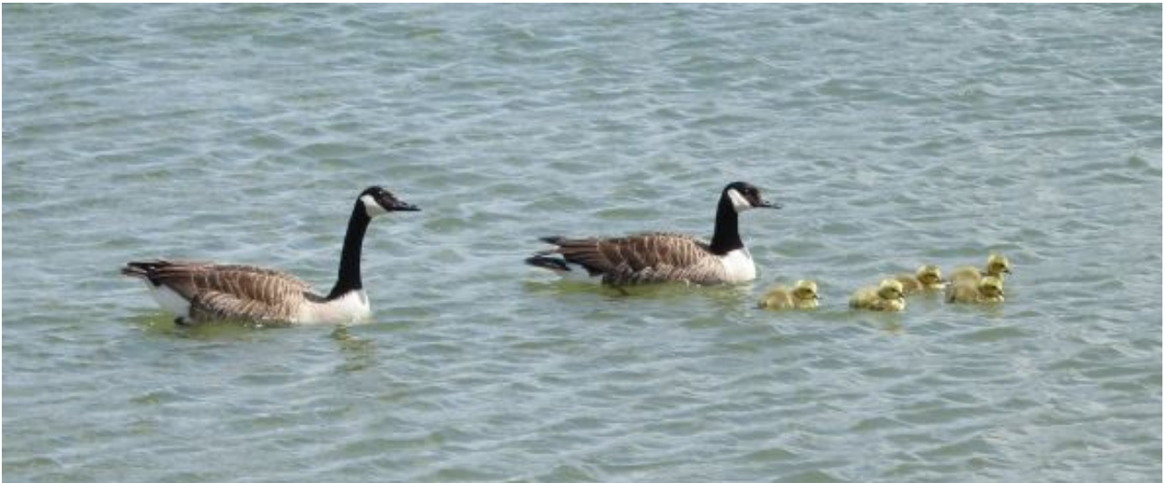
Canada Geese with 5 goslings 14 th May