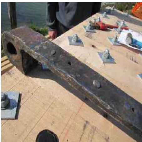
Recycled hinge being refitted

We are very grateful for the financial assistance received from Chichester Harbour Conservancy, Southbourne Parish Council and several private donors. In all we have had promises of over £4,000 towards an overall cost of over £10,000. As ever we would welcome more contributions.