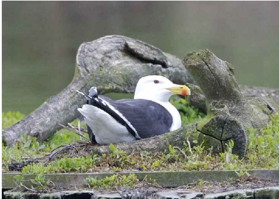
Greater Black-backed Gull nesting on a raft in the pond