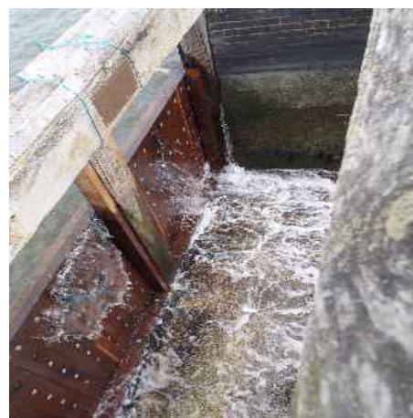
Gates in position