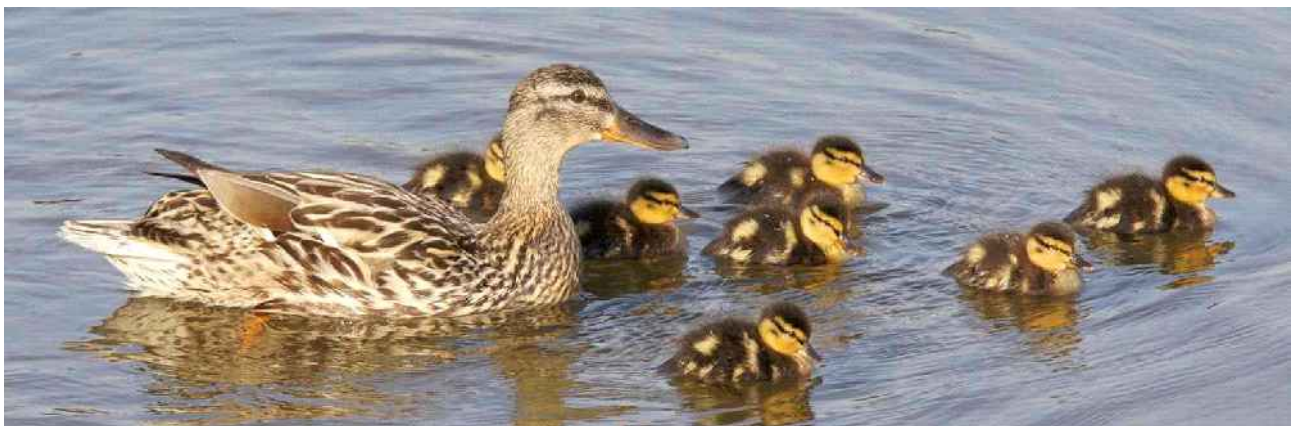
Mallard