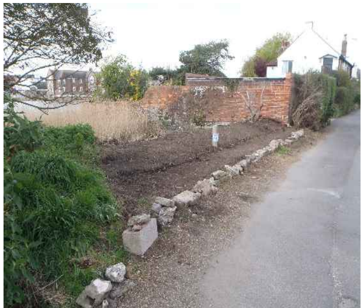
Newly-planted rustic hedge

Insects haven't been prominent, with the exception of bumblebees, a few weeks back when it was much warmer. I hope they weren't too quick off the blocks.