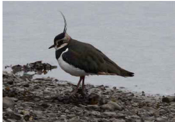
Lapwing