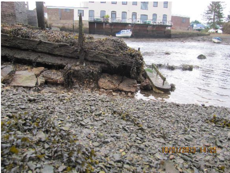
Erosion on the West flank of the spillway