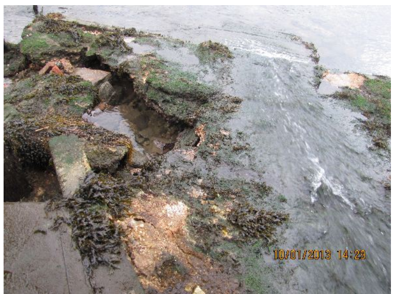
East side showing undercut voids