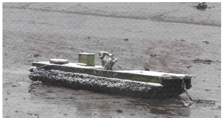
Bird raft on mud – note build-up of tube worm below water level

A pair of swans has been exploring the pond and seemed to be eyeing up a nesting site on the West Bank. Has anyone the skill to tell them that they are in danger of being washed away at a high Spring Tide??? Coots have been marking out their territory in their inimitable fussy way. The greater