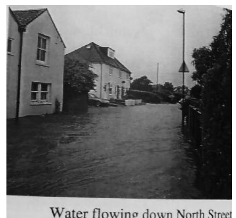
Water flowing down North Street

The wet weather remained with us for the rest of the summer, into the autumn. The countryside was saturated and groundwater levels were at an all-time high.