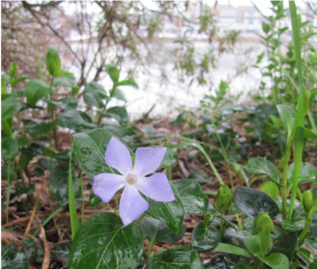
Periwinkle on pond bank - 14 Jan 2013