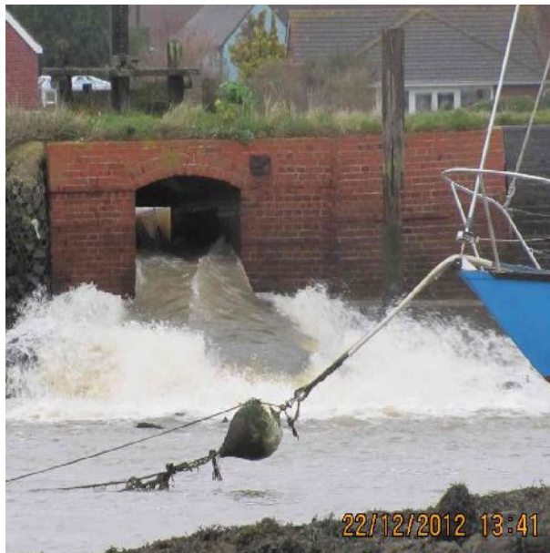
Note the extent of the turbulence to the sides