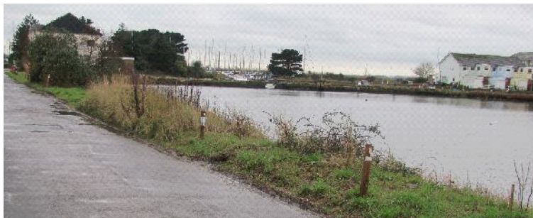
East Bank - looking South

The East bank looks shorn following the November Work Party and signs of Spring are just starting to appear – several of the transplanted daffodil clumps as well as bluebells are starting to sprout. A solitary Periwinkle was spotted the other day – hopefully many other flowers will follow.