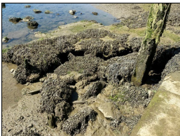
Damaged Sluice Apron viewed from footbridge

The initial clear up will be done by the SMPPA (led by Jim Hailstone) and includes: removal & disposal of approx 15 old cement bags; removal and disposal of the redundant wooden post; and clearing of seaweed using a petrol power washer.