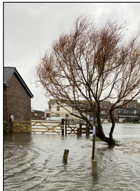
Gate partly submerged on high tide of 7 th December 2021

The steel lumps remaining at ground level by the pedestrian gate (former bike rack, also rotten) will be removed to reduce any trip hazard.