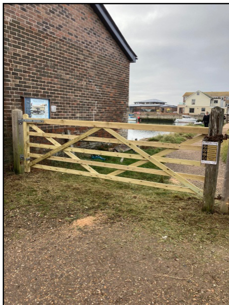
New gate at south-east corner

A new gate has been fitted in the south-east corner as the old one was rotten. 'Prikkastrip' has been installed along the top of the gate, to provide a deterrent to those tempted to sit on it.