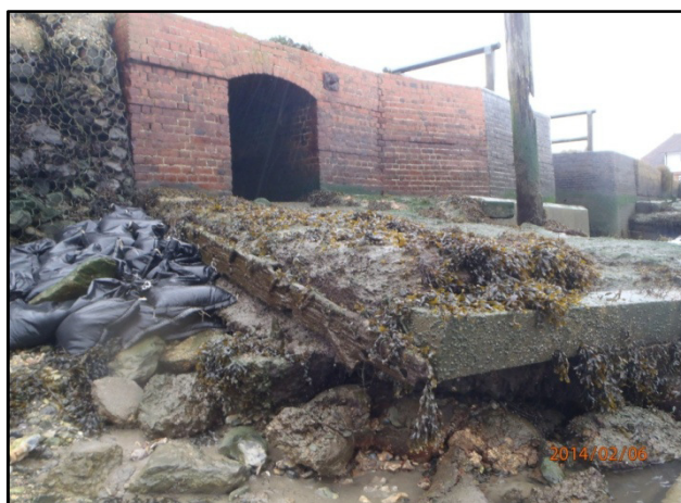
Damaged Sluice Apron viewed from the south showing rotten post to be removed

ABJ will carry out the following: return concrete lumps washed out from earlier sluice flows to roughly the area they were before being displaced; place shuttering around the area to which new concrete will be applied; infill any large gaps with pebbles / ballast (if needed); install wire mesh across the top (if needed); supply and deliver 4m of concrete with special mix (sulphur) suitable for sea water immersion prior to setting (using small Minimix lorry to pass through gate and mix on site); pump concrete to apron using hired Arun pump; float concrete in place to create smooth apron; remove & return shuttering, clear any other arisings.