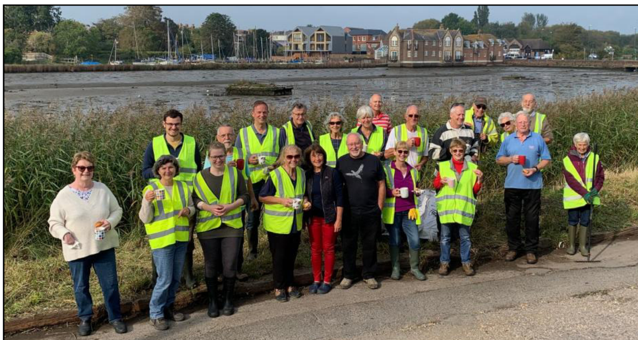
A selection of our 30 or so work party helpers – 9 th October 2021