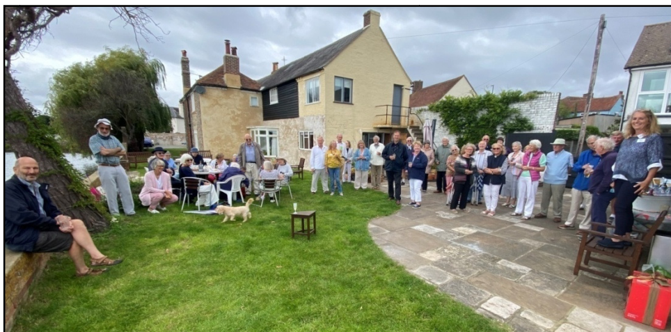
Slipper House – August 2021