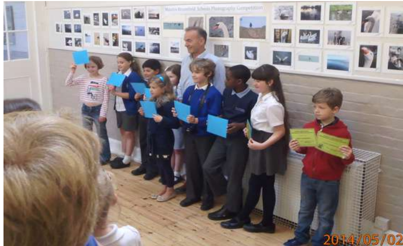
Maurice Broomfield Photo Competition