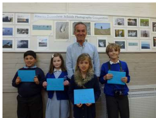
Winners and Runners Up (left to right) with film maker Nick Broomfield.