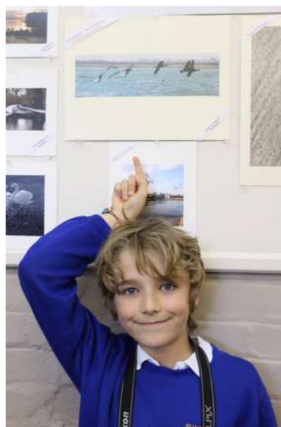
Winner with his winning image 'Free Flying Flock'.