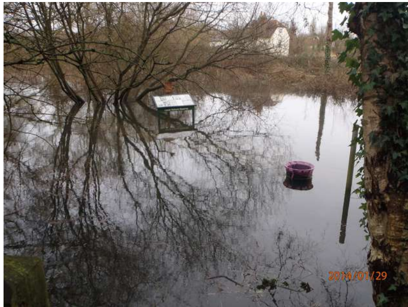
South Meadow and Gooseberry Cottage from footpath

Solutions to relieve the high water levels in Brook Meadow's South field which overflowed into the cottage garden are being explored including modifying the outfall structure that discharges into Peter Pond.