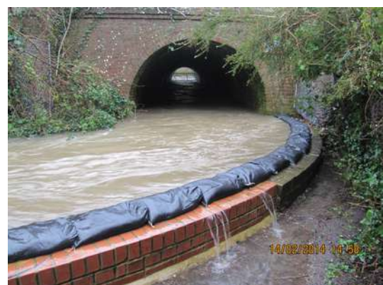
Wall to be raised by 50cm.