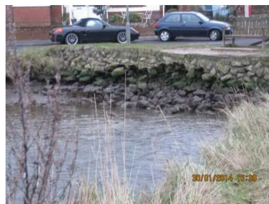
Damage at South-East corner

Final details are being costed at present to modify the road drainage into Peter Pond, raise lower sections of the bank and repair the facing in front of the bench in the South-East corner. We are liaising with the team and will be draining the Slipper Pond and thus Peter Pond to make work easier. Work is programmed to start in October – timed to minimise its environmental impact.