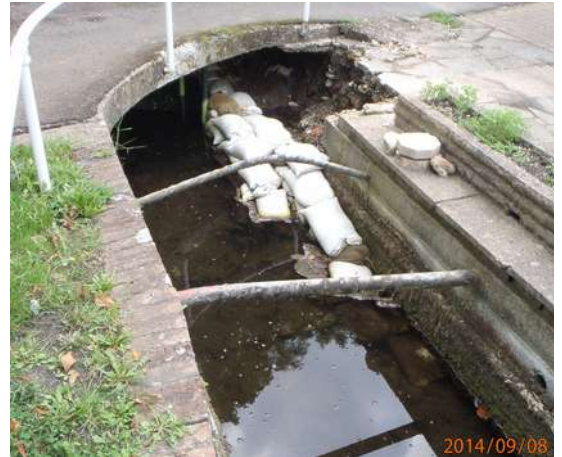
Looking downstream with ruined abutment removed

The West abutment of the bridge was undercut by the stream in flood and has failed. Failed and exploratory repair works have started. The whole area is being considered as any more deterioration threatens to further obstruct the stream in front of the cottages potentially causing flooding.