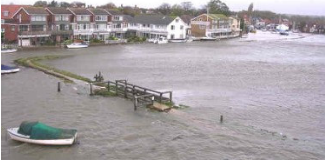
Slipper Mill Pond - South and West Banks - 13.03 - 3 November 2005

The Environment Agency sent out a flood warning for the midday tide, and flooding did occur. Lumley Road was covered and impassable for a time and Slipper Road was covered. Tide heights were significantly higher than predicted as shown in the official tide graph for Portsmouth..